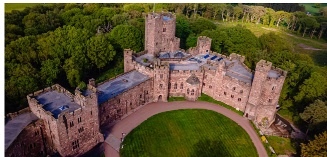
Peckforton Castle Peckforton Castle Dr, Stone House Ln, Cheshire, Tarporley, CW6 9TN