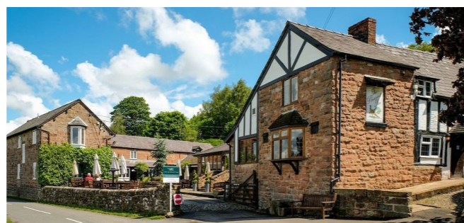
Pheasant Inn Higher Burwardsley, Tattenhall, Cheshire, CH3 9PF