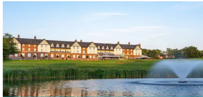
Carden Park Hotel Broxton Road, Nr Chester Cheshire, CH3 9DQ