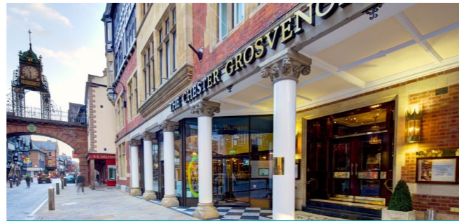
Chester Grosvenor 56-58 Eastgate St, cheshire, Chester, CH1 1LT