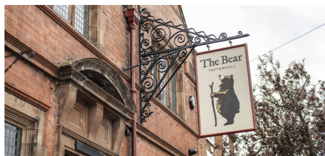
The Bear in Tattenhall High St, Tattenhall, Chester, CH3 9PX