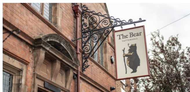
The Bear in Tattenhall High St, Tattenhall, Chester, CH3 9PX