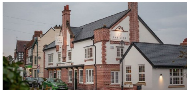
The Lion at Malpas 1 Old Hall St, Malpas, SY14 8NE