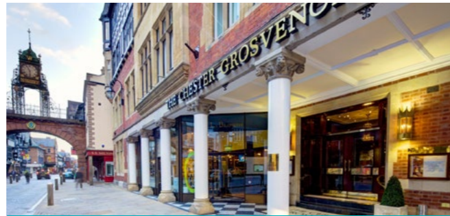
Chester Grosvenor 56-58 Eastgate St, cheshire, Chester, CH1 1LT