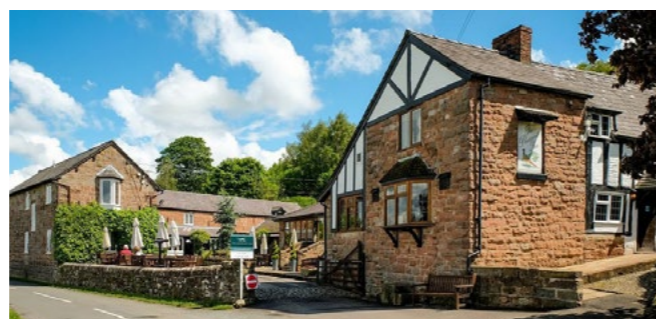
Pheasant Inn Higher Burwardsley, Tattenhall, Cheshire, CH3 9PF