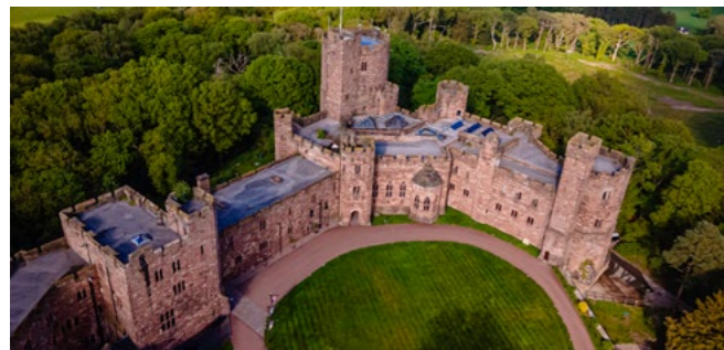
Peckforton Castle Peckforton Castle Dr, Stone House Ln, Cheshire, Tarporley, CW6 9TN