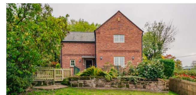
Sandstone 34 Burwardsley, Chester, CH3 9PH