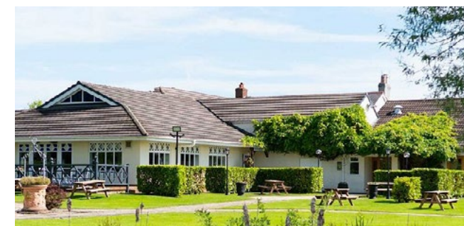
Hotel Wrexham Wrexham Rd, Holt, Wrexham, LL13 9SW