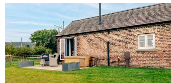
Bolesworth Bothy Burwardsley Road, Tattenhall, CH3 9PH