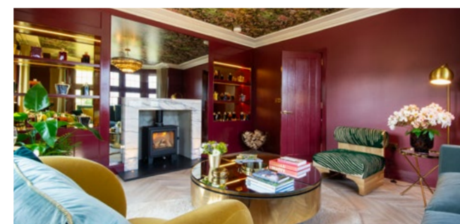
Liongate Lodge Liongate Lodge, Bolesworth Road, Tattenhall, CH3 9HL