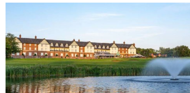
Carden Park Hotel Broxton Road, Nr Chester Cheshire, CH3 9DQ