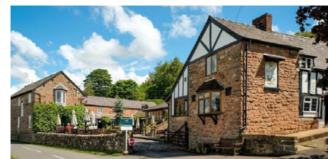
Pheasant Inn Higher Burwardsley, Tattenhall, Cheshire, CH3 9PF