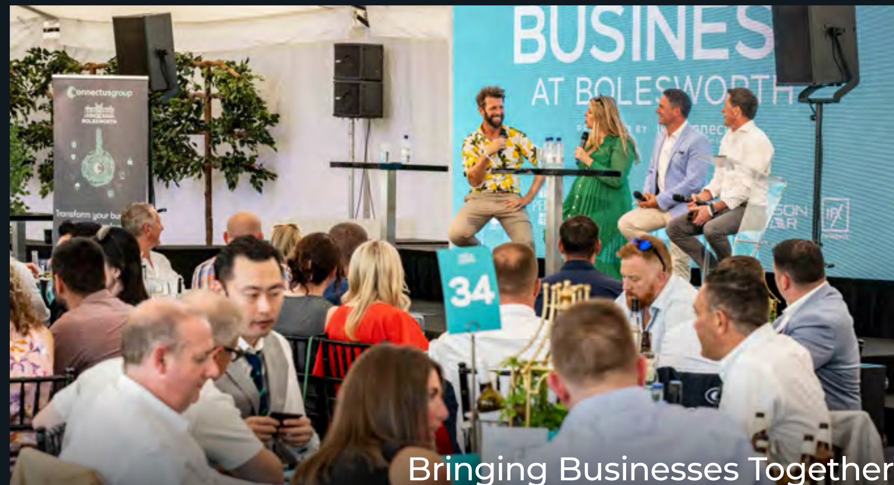
Bringing Businesses Together