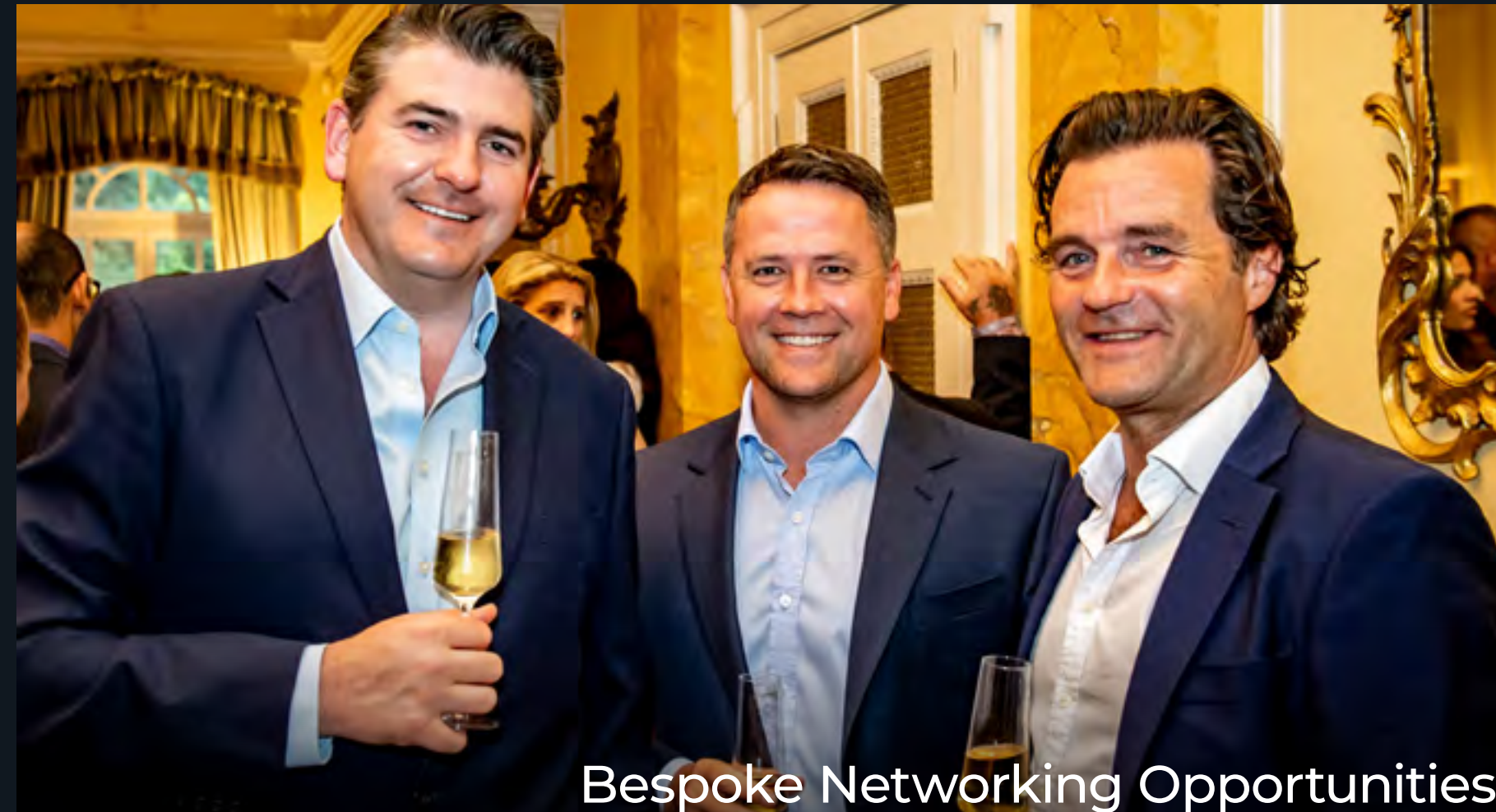
Bespoke Networking Opportunities