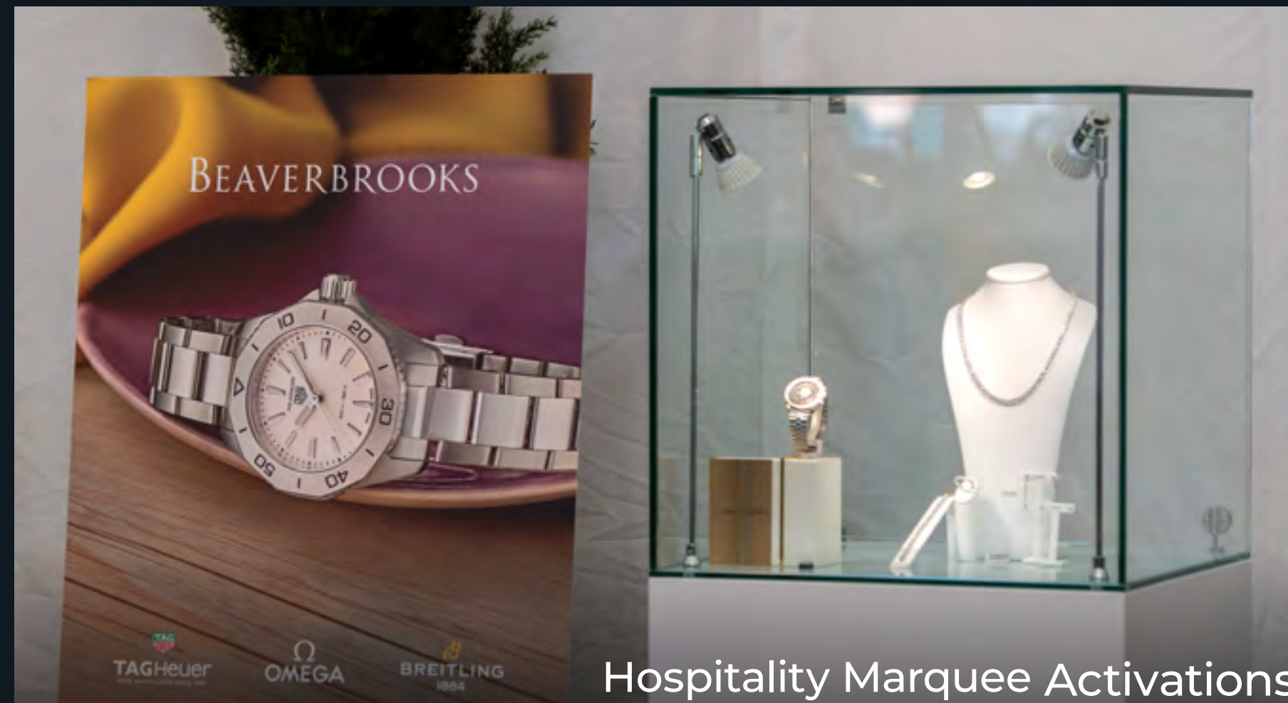
Hospitality Marquee Activations