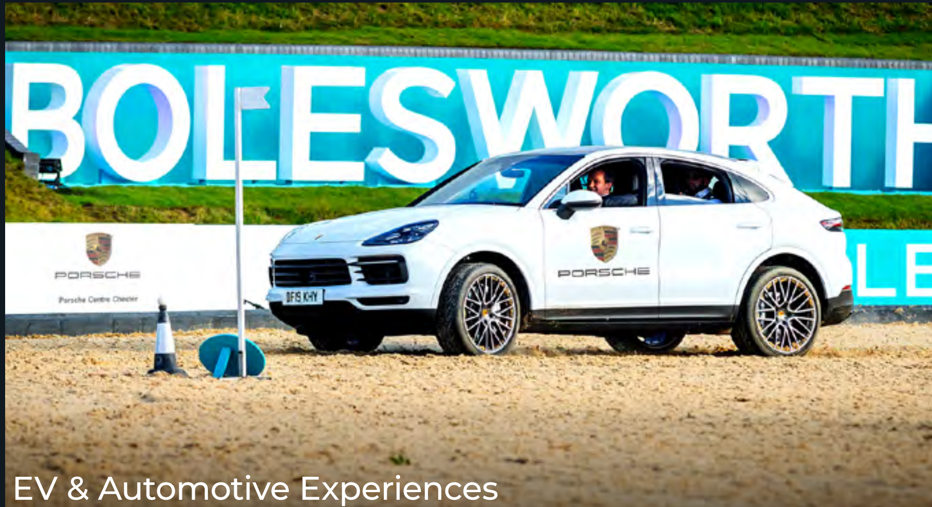
EV & Automotive Experiences