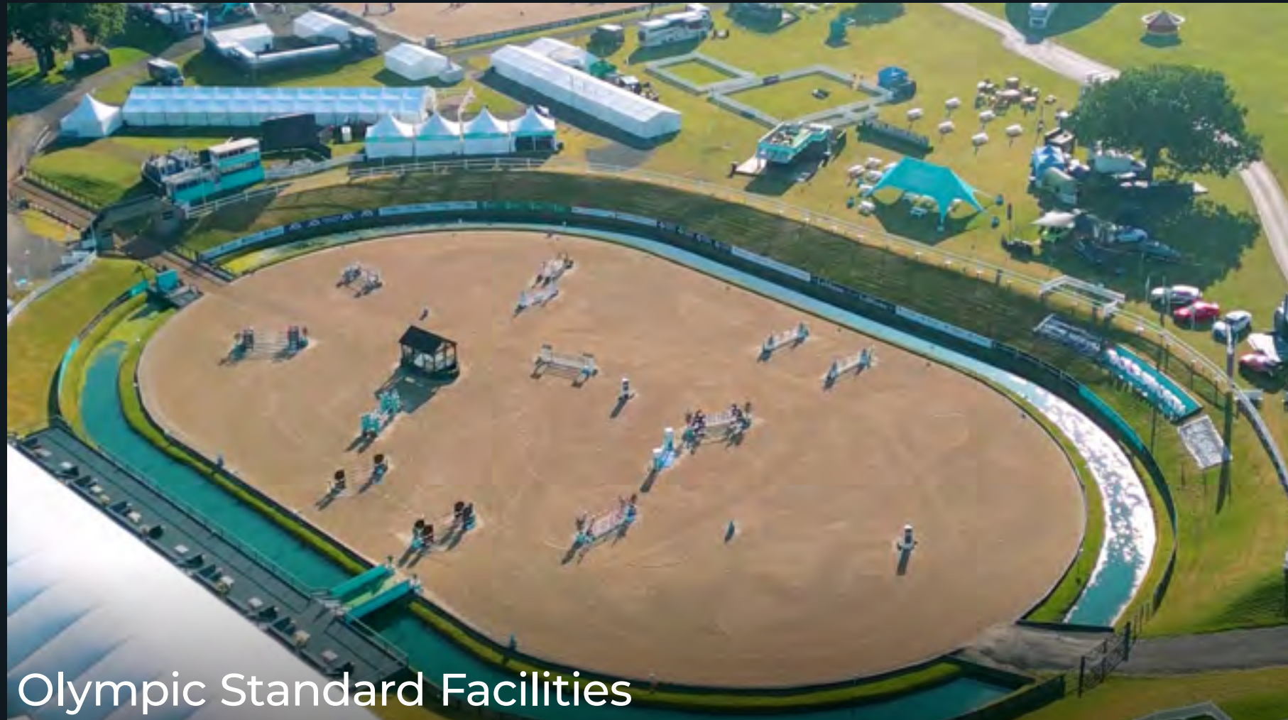
Olympic Standard Facilities