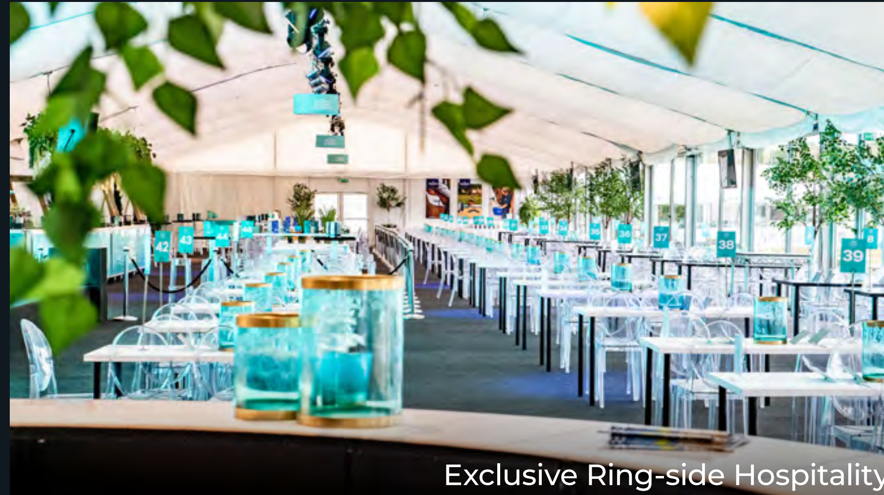
Exclusive Ring-side Hospitality