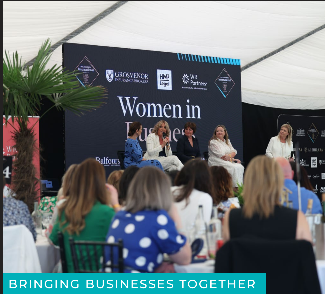
BRINGING BUSINESSES TOGETHER