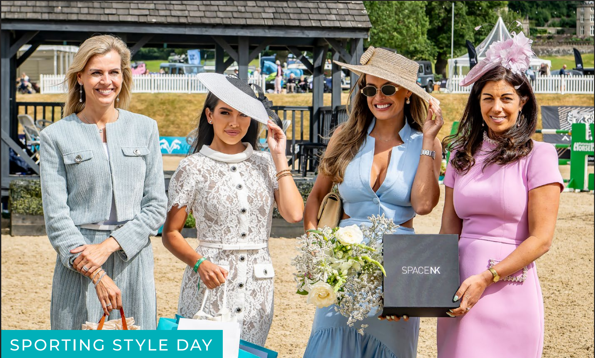
SPORTING STYLE DAY