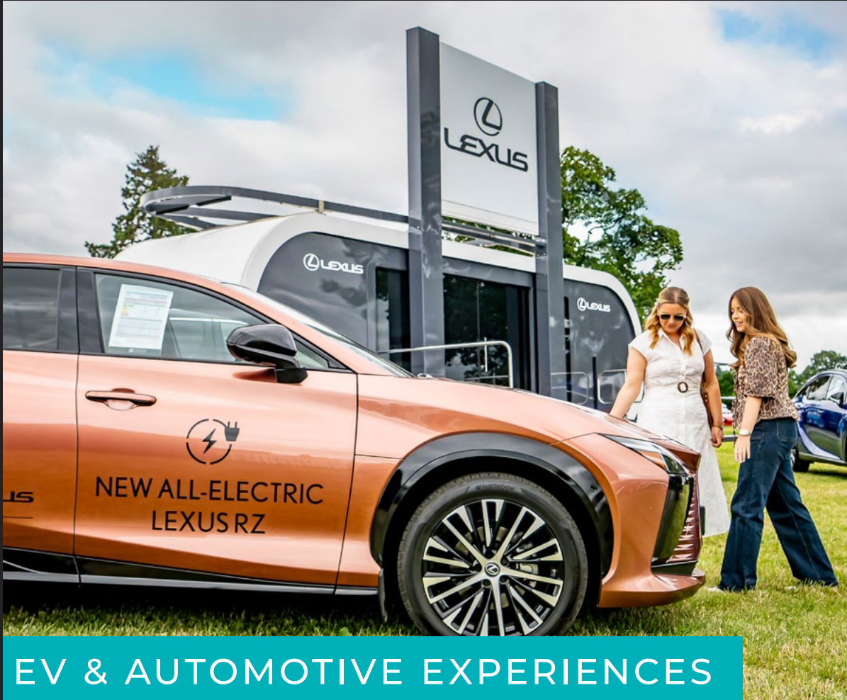
EV & AUTOMOTIVE EXPERIENCES