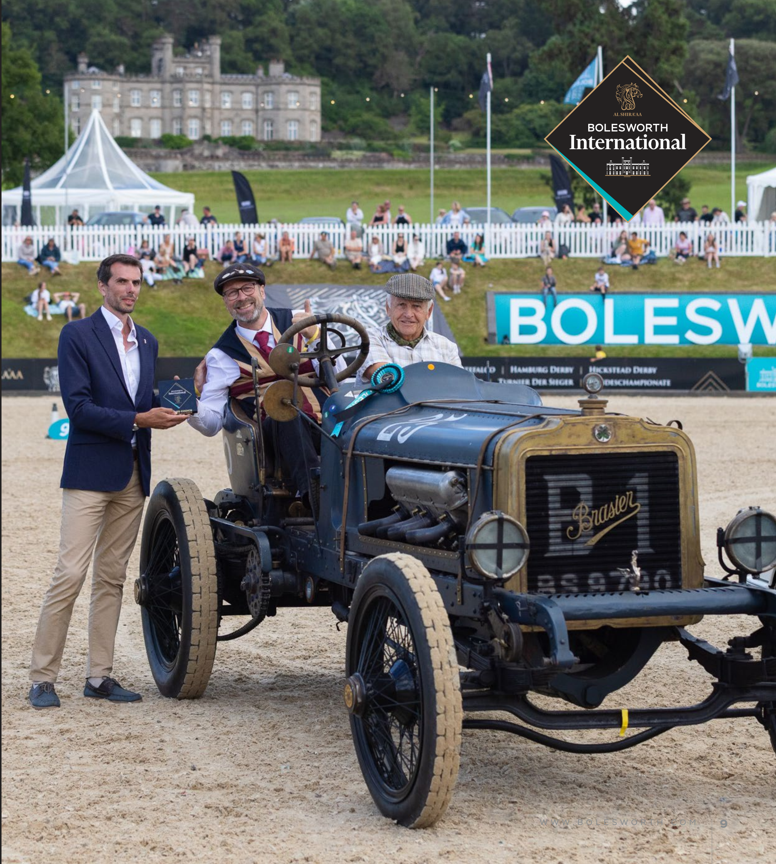
1908 BRASIER (RACED AT GOODWOOD)

“On behalf of the Chester Vintage Enthusiasts Car Club I would like to thank you for your invitation and hospitality at Bolesworth on Saturday. Our members really enjoyed the event especially the owner of 1908 Brasier, who won the People's Choice award. Thank you once again.”