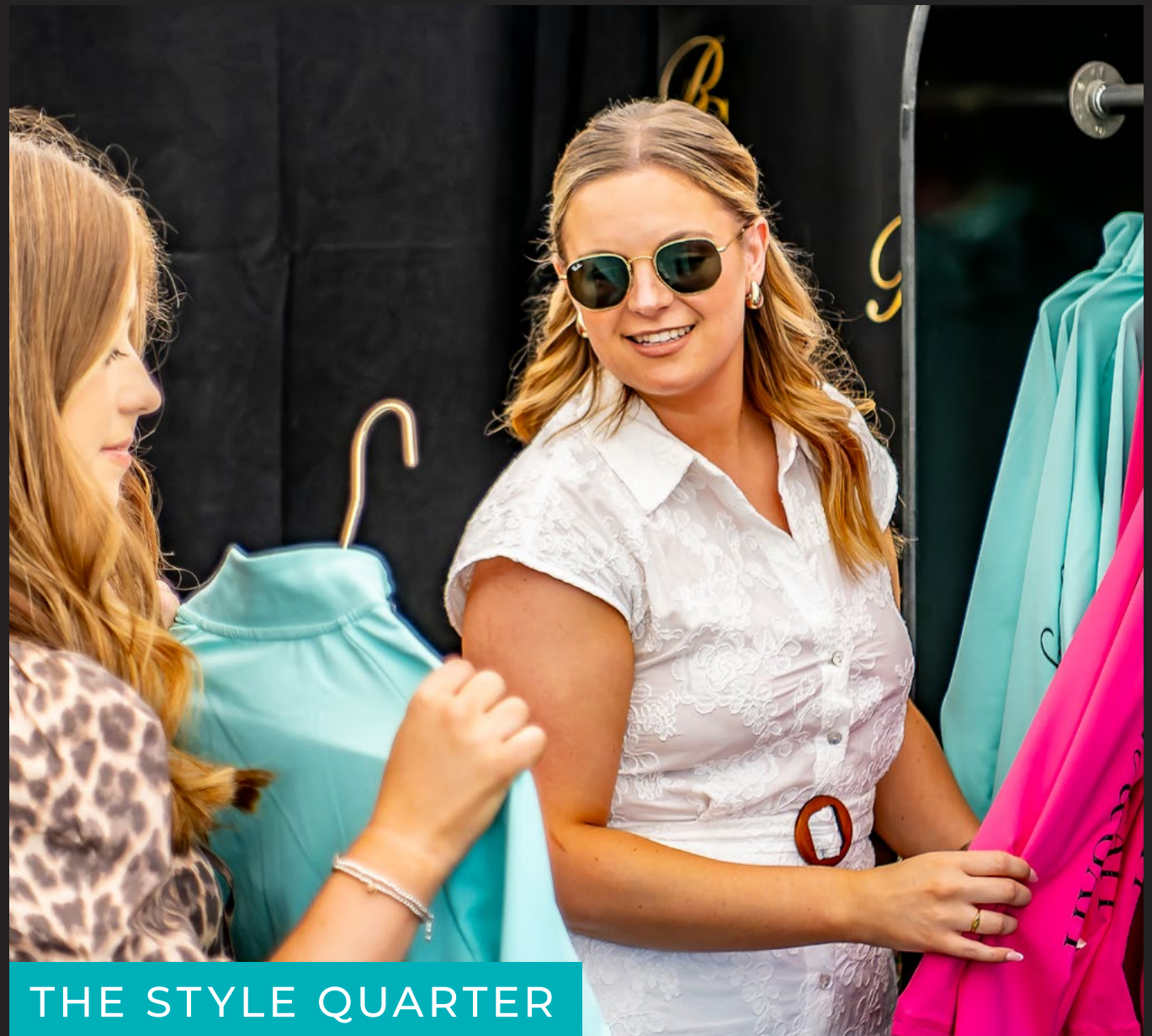
THE STYLE QUARTER

Blending sport and style in an atmosphere of relaxed elegance