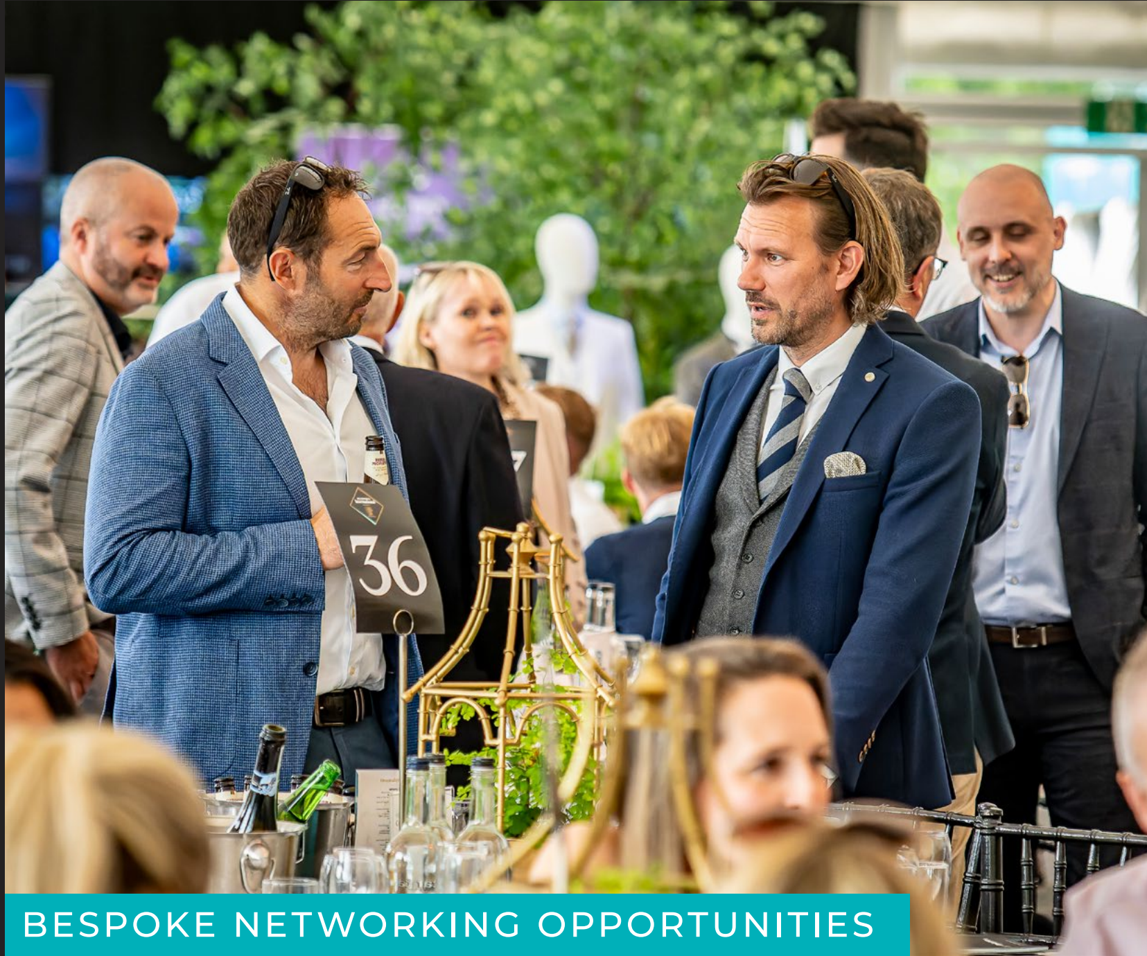
BESPOKE NETWORKING OPPORTUNITIES