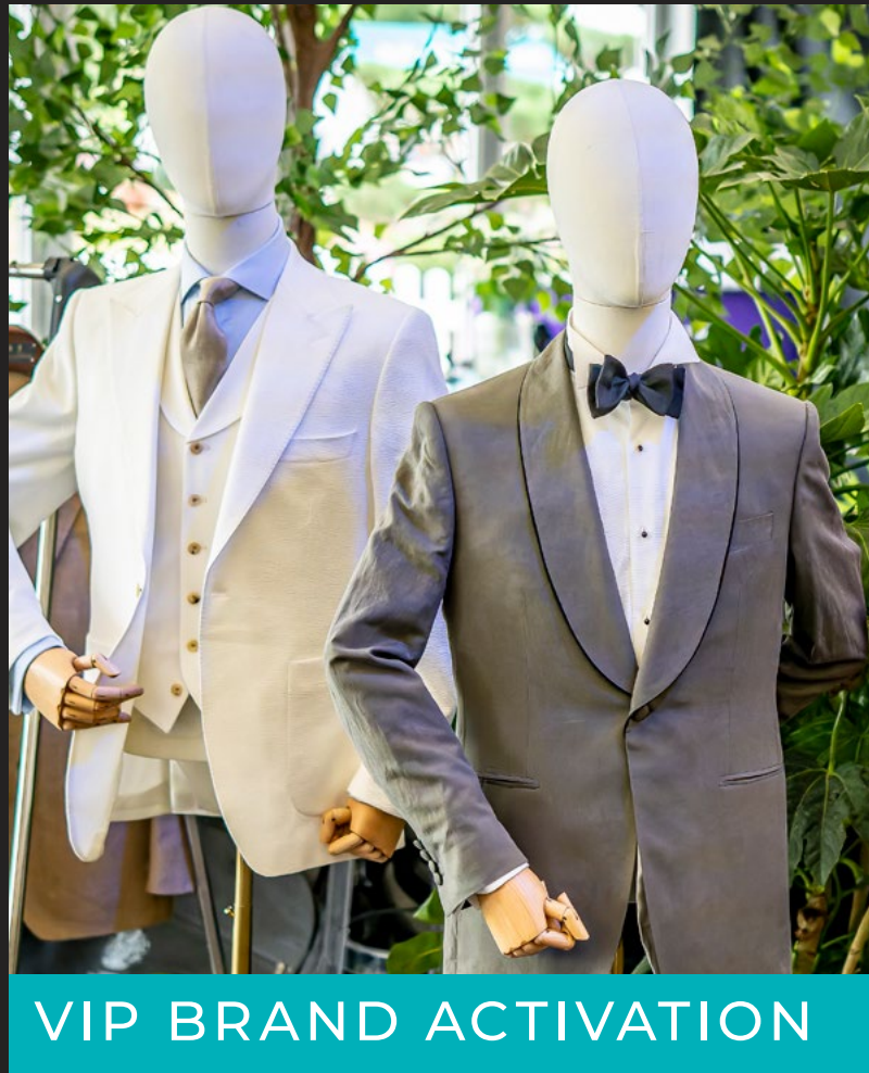
VIP BRAND ACTIVATION