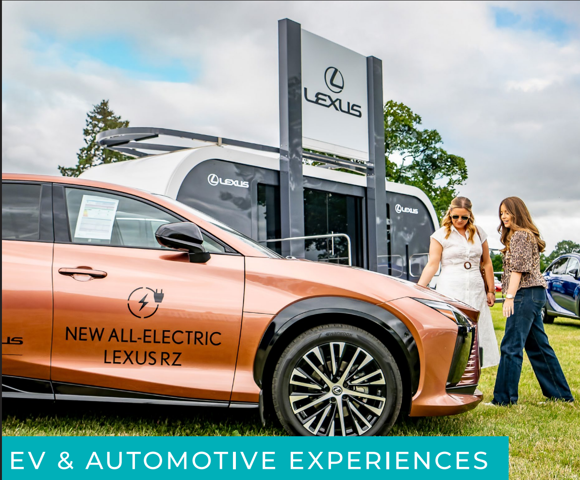
EV & AUTOMOTIVE EXPERIENCES