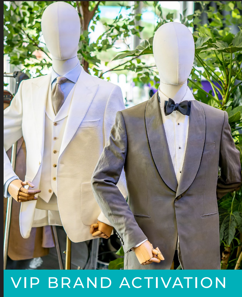
VIP BRAND ACTIVATION