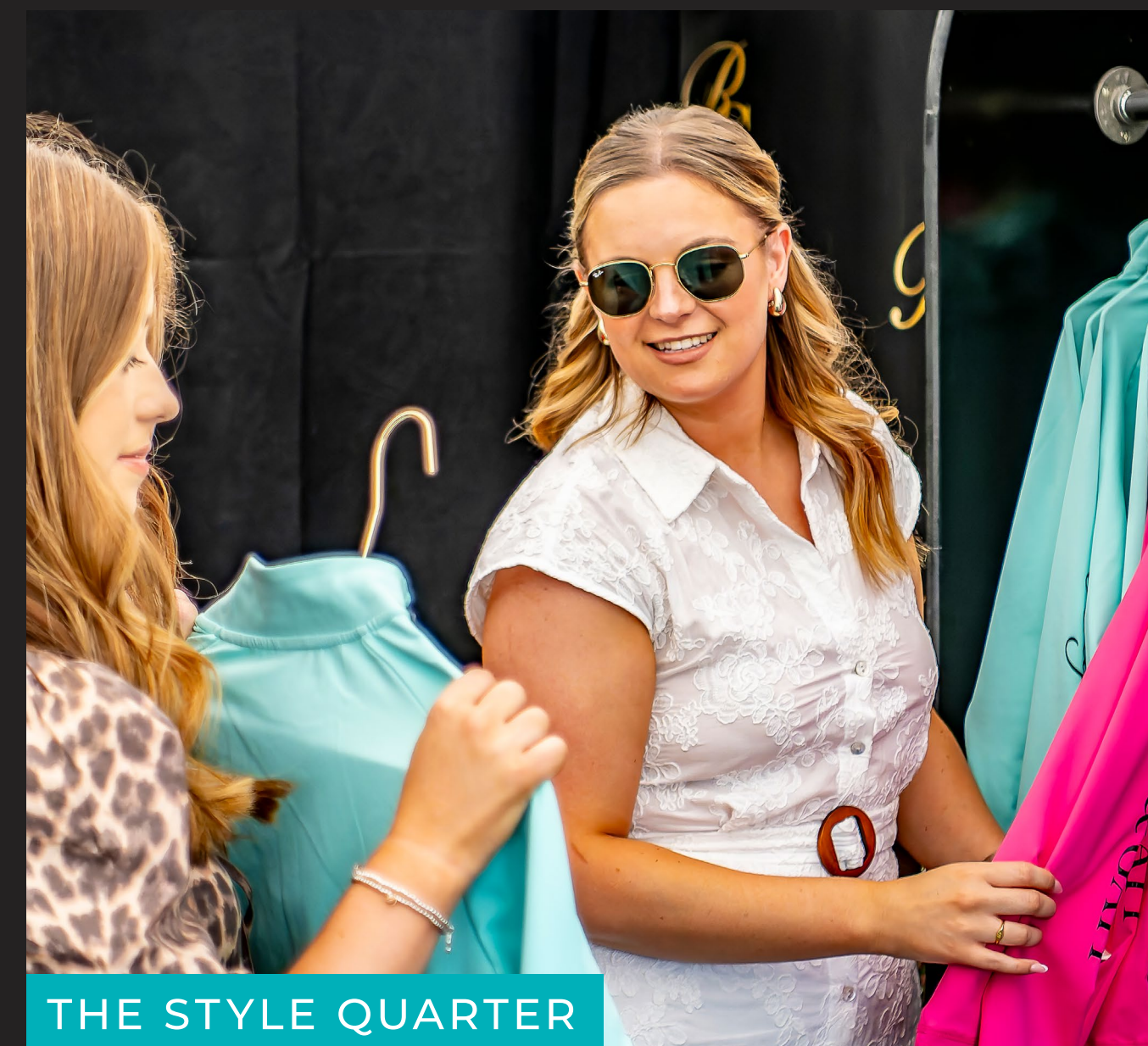
THE STYLE QUARTER

Blending sport and style in an atmosphere of relaxed elegance