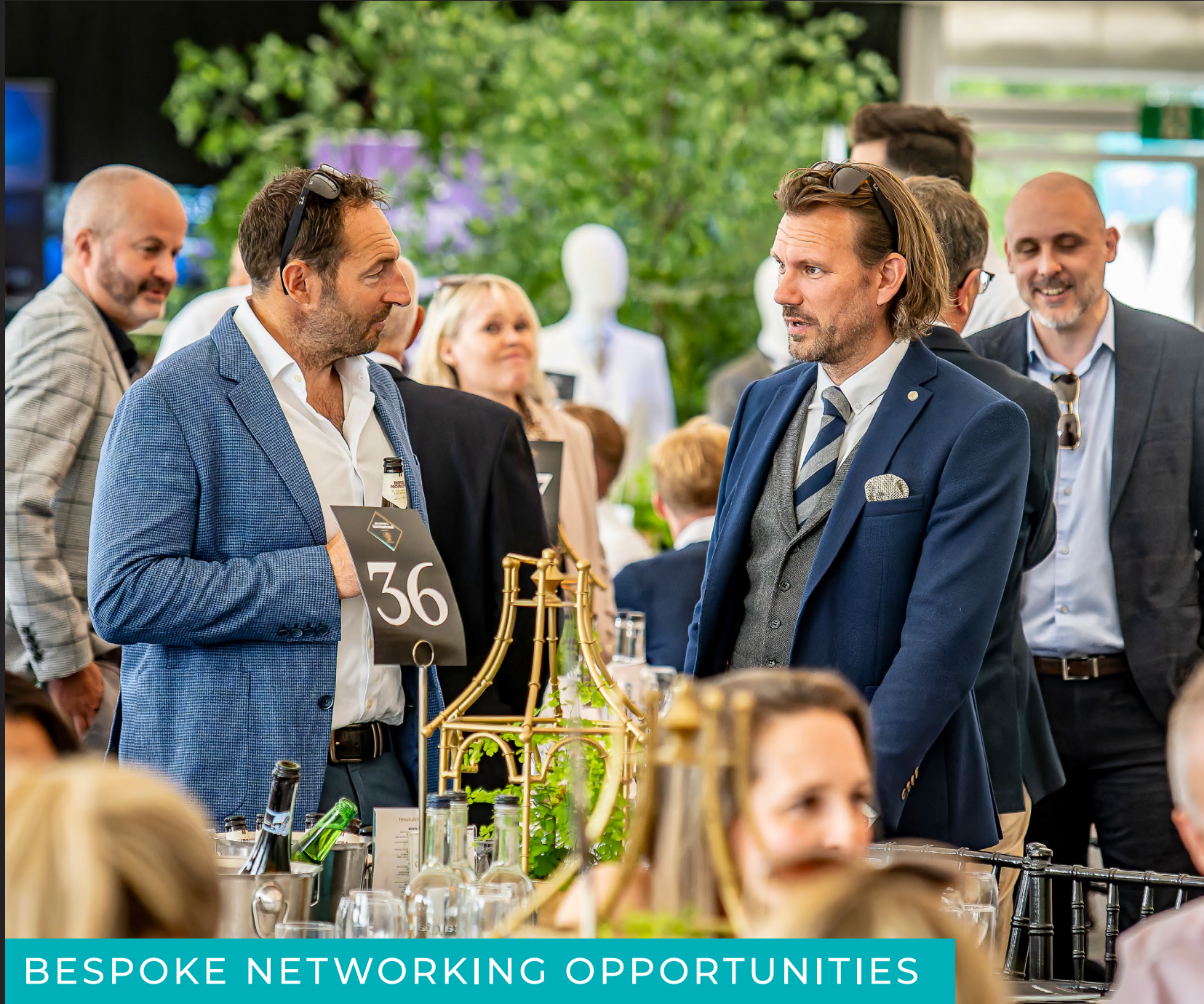
BESPOKE NETWORKING OPPORTUNITIES