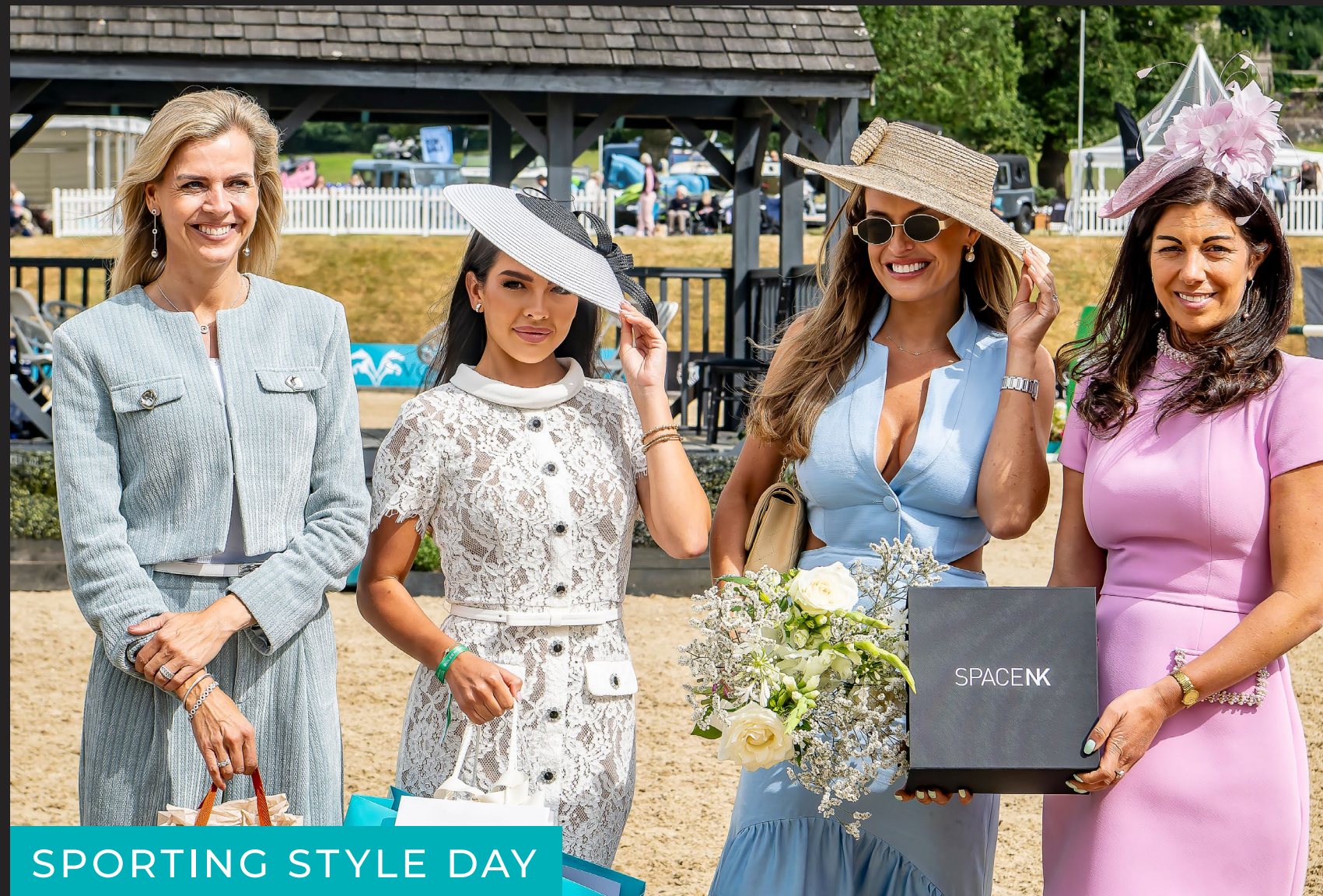
SPORTING STYLE DAY